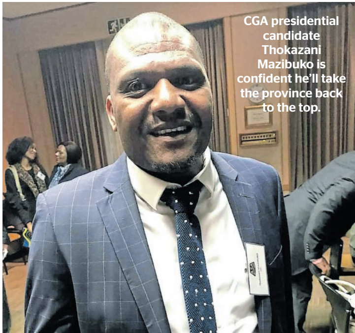
CGA presidential candidate Thokazani Mazibuko is confident he'll take the province back to the top.