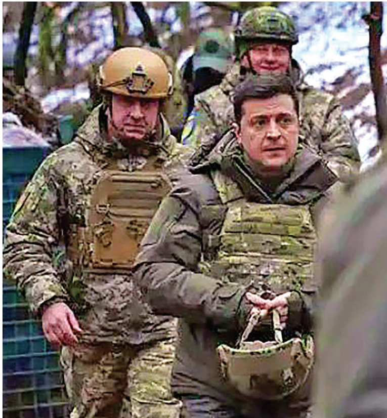
Ukrainian President Volodymyr Zelenskyy in the trenches as Russia continues its war against his country.

On Tuesday, Pandor said South Africa was calling for